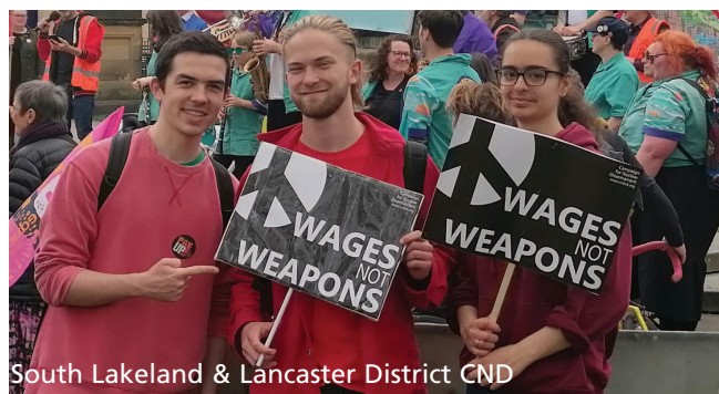
South Lakeland & Lancaster District CND

people signed petitions, bought badges, and asked questions.