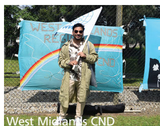
West Midlands CND