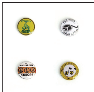
Vintage Badges 50p