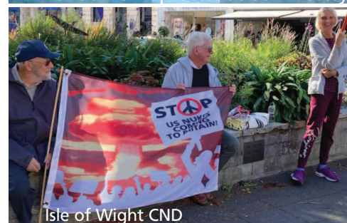
Isle of Wight CND