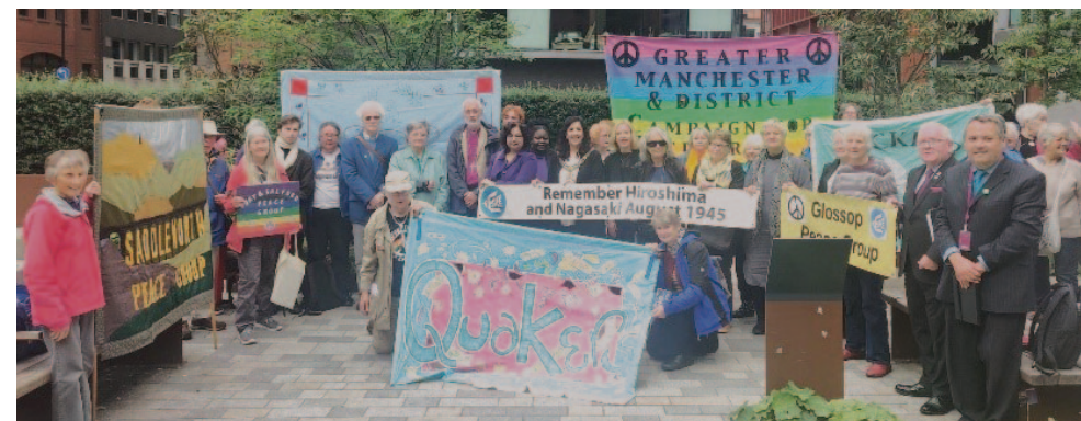
Greater Manchester and District CND

arranged well-supported events included South Lakeland and Lancaster District CND, Tavistock Peace Action Group, and Merseyside CND.