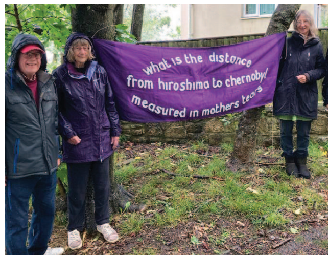
Isle of Wight CND

Street. By Nagasaki Day, the weather had cleared and the group held a peace picnic with statements, poems and singing.