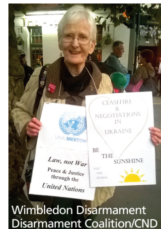
Wimbledon Disarmament Coalition/CND

CND groups, including Bromley Borough CND , got involved with resisting the DSEI arms fair in London. Kingston Peace Council/CND co-organised an event as part of the actions, while CND organised a webinar with guest speakers including the local mayor. Kingston Peace Council/CND also protested the annual International Armoured Vehicles Conference. Hundreds of leaflets were delivered door-to-door in the vicinity of the venue prior to the event, and highly visible protests