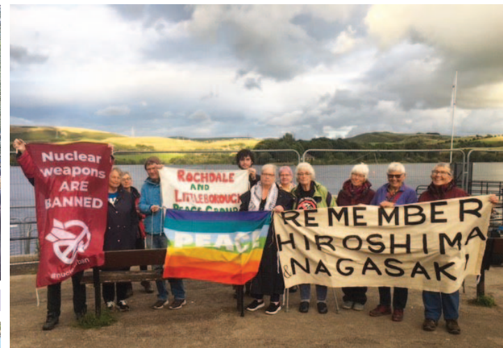
Rochdale and Littleborough CND