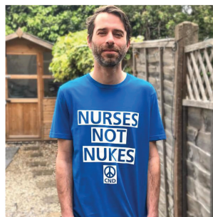
Nurses Not Nukes T-shirt £11