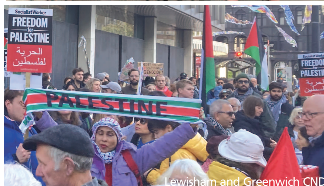
Lewisham and Greenwich CND

CND also attended the rally. The militarisation of space is a growing concern for peace activists. Greater Manchester & District CND organised a webinar on the UK's contribution to this.