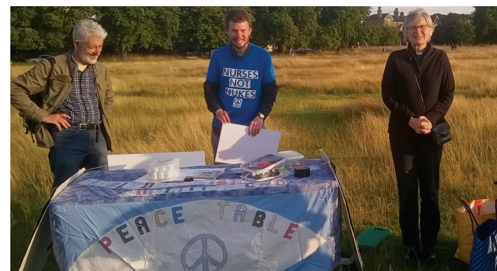
Wimbledon Disarmament Coalition/CND