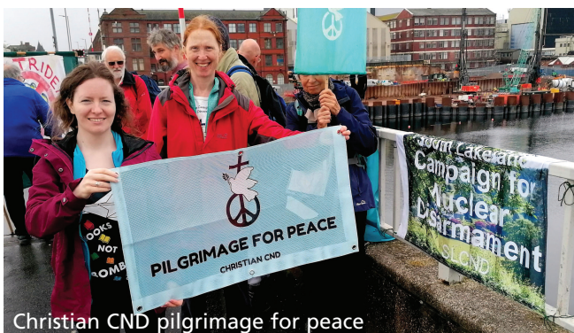
Christian CND pilgrimage for peace

Norwich and District CND continued to support the monthly peace vigils in Norwich city centre. The group has made an important decision on the future of their annual Peace Camp – watch this space! They had a very well-attended stall at the Burston Strike School rally and march, where their T-Rex banner – “too much – too little brain – now extinct!” was praised! Scores of