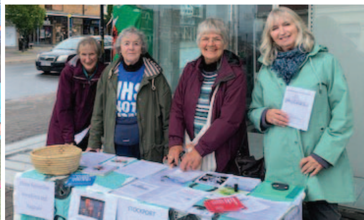
Stockport for Peace