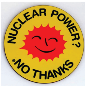
Nuclear power? No thanks Coaster £4