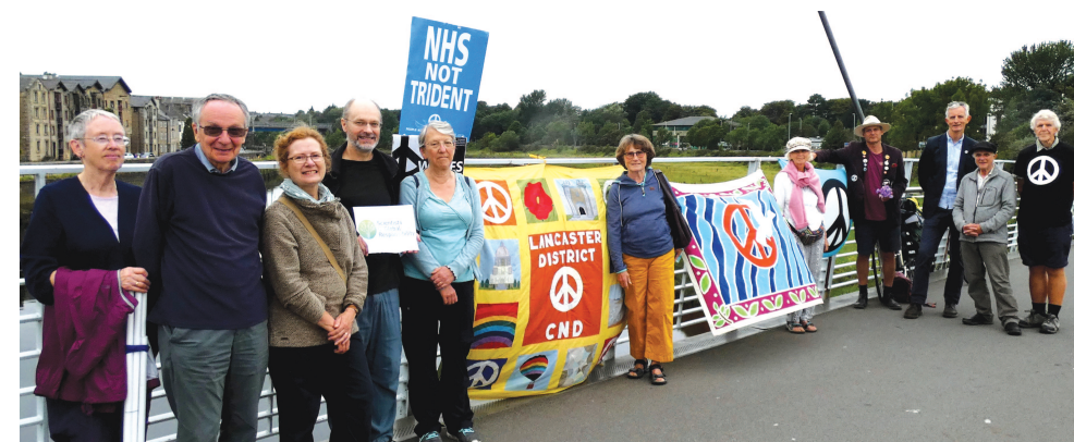
South Lakeland and Lancashire District CND