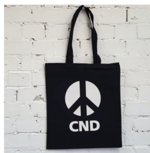
Tote Bags £7