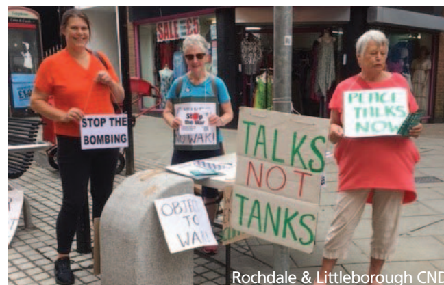
Rochdale & Littleborough CND

Abingdon Peace Group continues to hold a vigil every Monday morning, holding a banner that reads 'IN SOLIDARITY WITH PEACEMAKERS IN ALL CONFLICTS'. The group put up a display in their local library on 'Creating a World Without War'. And with other local peace groups, they organised a rally outside Croughton USAF base as part of Keep Space for Peace Week. West Midlands