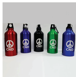
Water Bottles £8