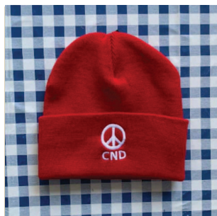
Beanie Hats £9