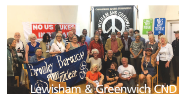
Lewisham & Greenwich CND