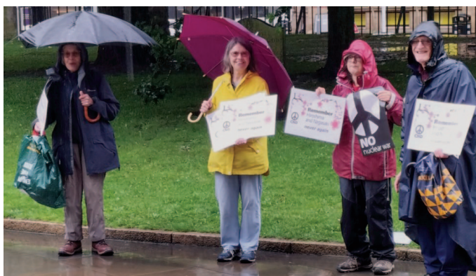
West Midlands CND