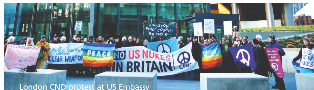
London CND protest at US Embassy

South Cheshire & North Staffordshire (SCANS) CND held a street stall to raise awareness of the demonstration, reporting back on a number of positive interactions with