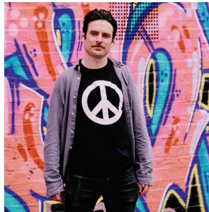
Logo T-shirt £15