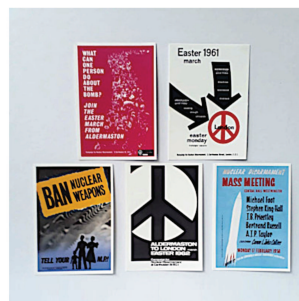
Postcards 5 for £2