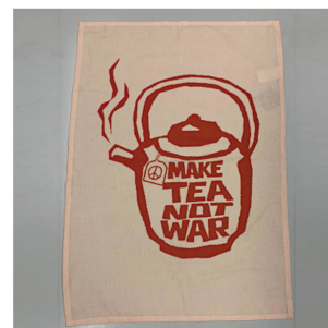
Tea Towels £8